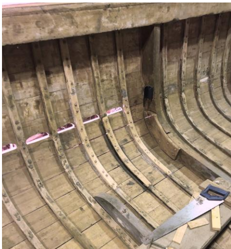
Replacement frame in laminated oak

The Antares is a 33ft wooden motor fishing boat made in the '70s. She is unusual in that the hull planking is made from a hardwood called iroko, rather than a soft wood like larch. Mike Griffin is working on replacing some worn out oak frame sections with laminated timber inserts. The timber is oak strips which are heated and bent on a jig and glued together in situ. The laminate construction is very strong, compared with solid timber and is an efficient use of wood. The joints between the existing frames and the new parts are staggered for strength. The carvel planking is fastened to the frames with copper rivets.