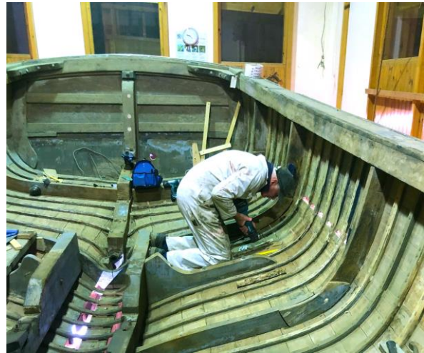
Mike Griffin replacing a section of frame

The Antares is a 33ft wooden motor fishing boat made in the '70s. She is unusual in that the hull planking is made from a hardwood called iroko, rather than a soft wood like larch. Mike Griffin is working on replacing some worn out oak frame sections with laminated timber inserts. The timber is oak strips which are heated and bent on a jig and glued together in situ. The laminate construction is very strong, compared with solid timber and is an efficient use of wood. The joints between the existing frames and the new parts are staggered for strength. The carvel planking is fastened to the frames with copper rivets.