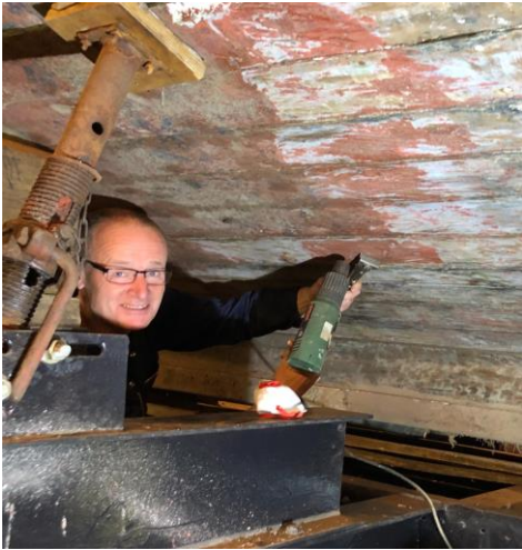
Stripping paint and removing caulking

Winter in the boatyard is a good time for work to be done on the current restoration project, the Antares . This involves stripping the entire hull down to the bare wood including cleaning all the seams prior to recaulking and repainting. In addition some of the internal timbers need attention.